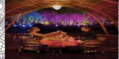
THE LIVING CINEMA TO REPRESENT THE ROMANTIC & FANTASY