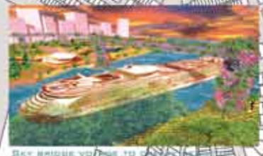
DAY BRIDGE VOYAGE TO EXPERIENCE AND FEEL