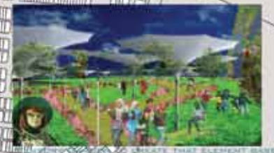
THE LIVING CINEMA TO REPRESENT THE ROMANTIC & FANTASY