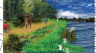
RAIN BARDEN TO ENJOY THE VIEW ALONG THE SEA