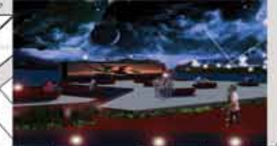
THE LIVING CINEMA TO REPRESENT THE ROMANTIC & FANTASY