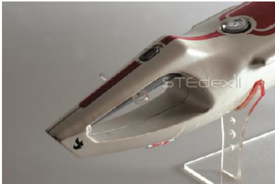
Handy Fire Extinguisher_1

In Malaysia, fire cases are caused by many factors. The lack of user's awareness towards the existence of fire extinguisher has been identified as one of the causing factors. This is due to the poor product appearance and non-user friendly. In addressing this issue, the designer conducted surveys and observation on users' understanding towards design appearance and function of the existing fire extinguisher. Through the analysis and design development process, the designer has successfully created a new external outlook for the fire extinguisher which emphasizes on aesthetic and function. Portraying an impressive styling, the new fire extinguisher model fulfills the aesthetic and functional aspects of design.