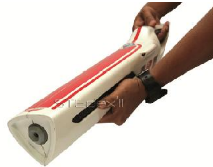
Handy Fire Extinguisher_2