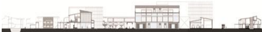
Reinvigorating Urban Community_9