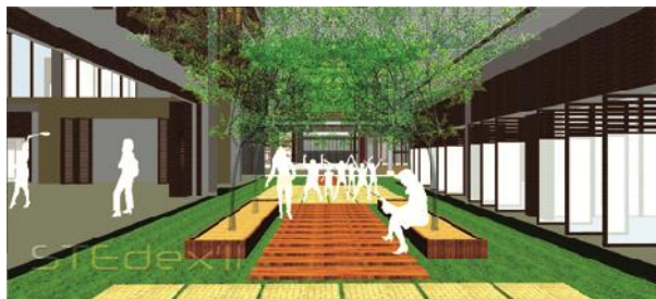
Reinvigorating Urban Community_5