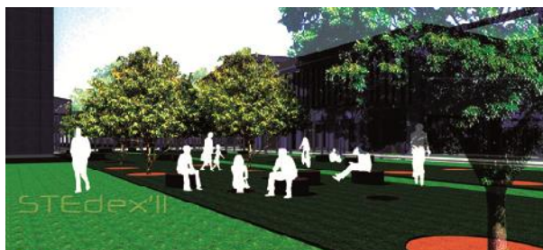
Reinvigorating Urban Community_3