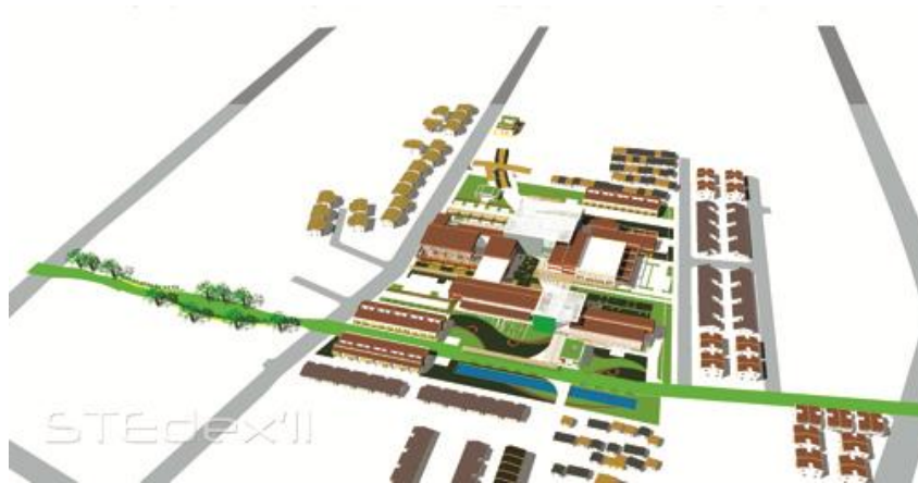
Reinvigorating Urban Community_10