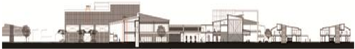
Reinvigorating Urban Community_8