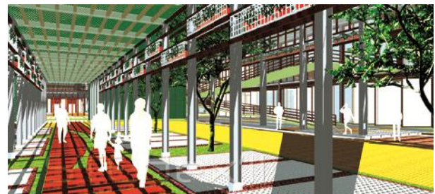
Reinvigorating Urban Community_6