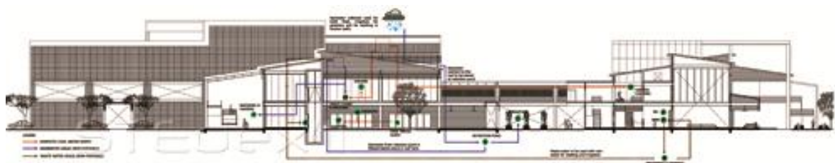
Reinvigorating Urban Community_7