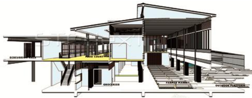
Reinvigorating Urban Community_2