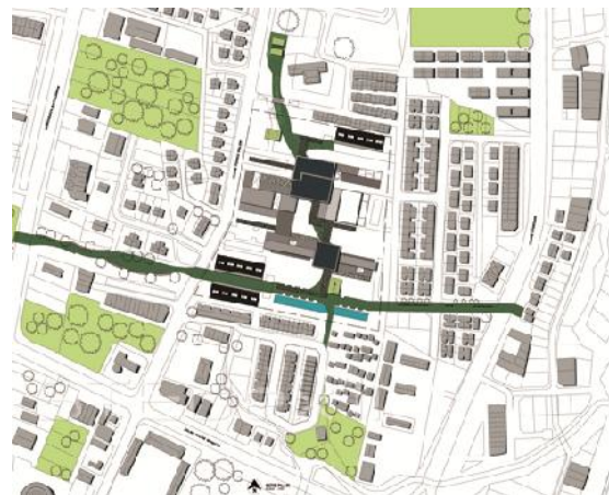
Reinvigorating Urban Community_12