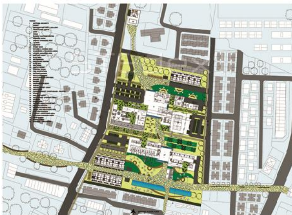
Reinvigorating Urban Community_11