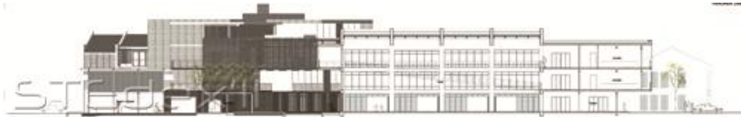
Pekan Cina Revitalization_8