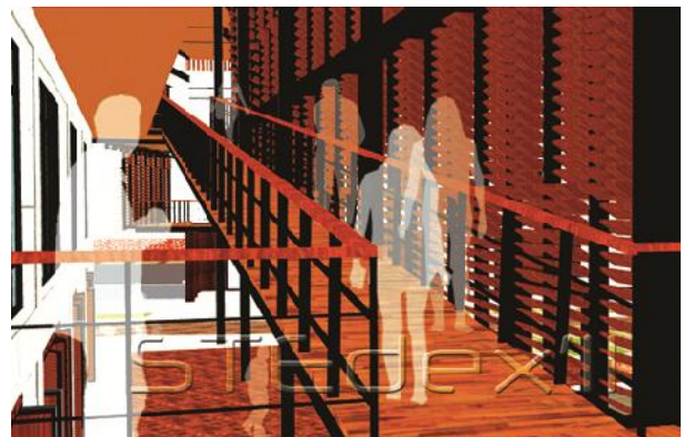
Pekan Cina Revitalization_5