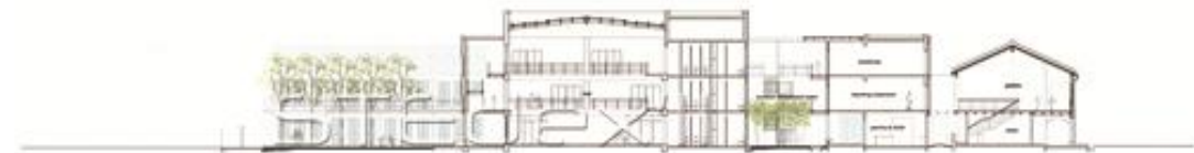
Pekan Cina Revitalization_10