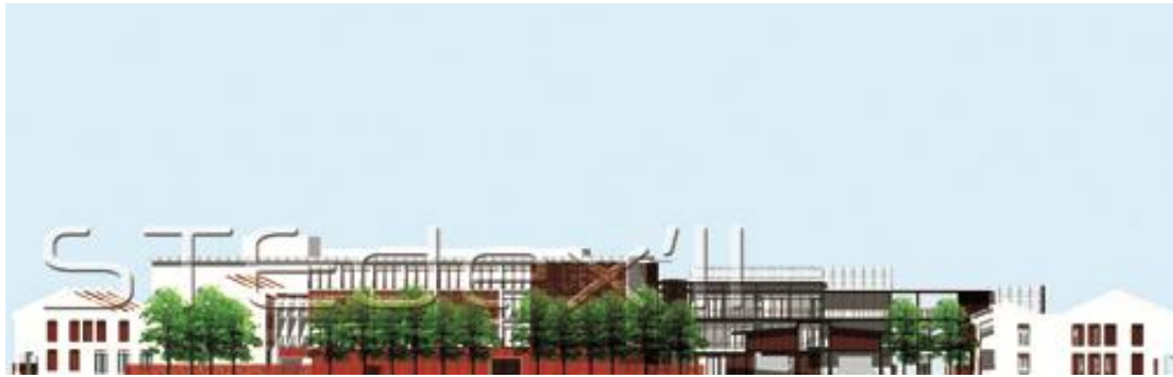
Pekan Cina Revitalization_7