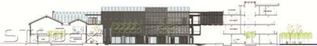
Pekan Cina Revitalization_9