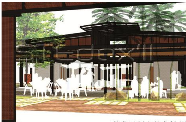
Pekan Cina Revitalization_4