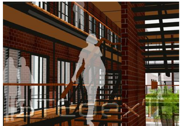
Pekan Cina Revitalization_3