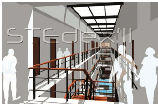
Pekan Cina Revitalization_6