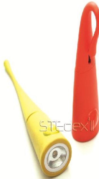
Personal Alarm for Kids_3