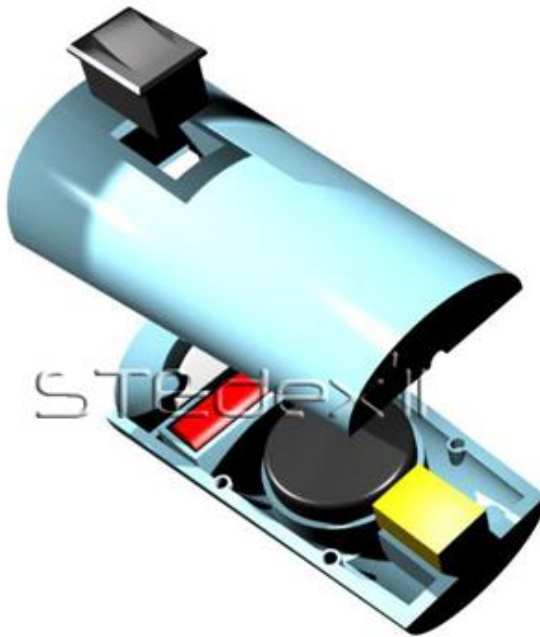
Personal Alarm for Kids_1

At present, child abduction cases in Malaysia are on the rise. The violence against children in the community occurs especially in places where children live and play. Although local authorities have introduced preventive actions to resolve this problem, the cases are increasing at an alarming rate. Therefore, in search for a design solution, the designer conducted a survey to obtain the respondent's level of awareness on children's safety and their knowledge on the current available self-defense devices. The design displays a product innovation that could help prevent children harassment, abduction and molestation. The alarm system incorporated in the product will equip children whenever they are out in the public and acts as a safety protection against psychological threat of criminals and bullies.