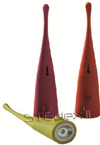
Personal Alarm for Kids_2