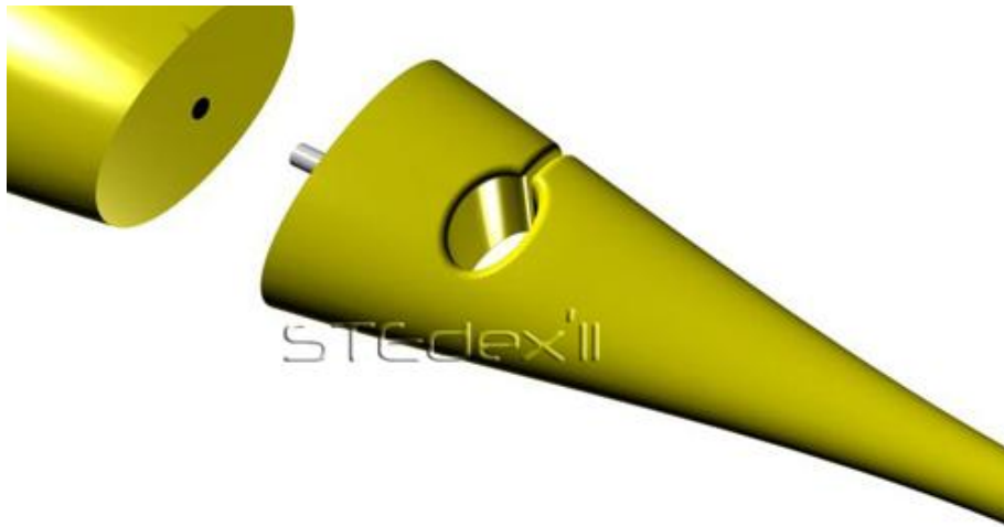
Personal Alarm for Kids_6