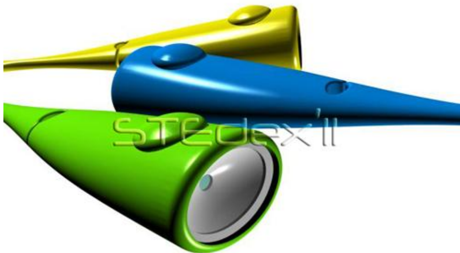
Personal Alarm for Kids_7