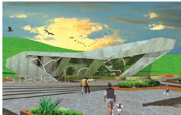
Visuospatially Of Destruction_1

A tectonic architectural form can reflect a natural area of disaster that is achieved through the visual and spatial design. The intention is to go beyond 'fictional realism of natural disaster' as visualized in the films and contextualizing the voluptuous imagery of form and content as a 'shared language' between the popular culture of film, public taste and architecture. Mohammad Hafizal's Film Gallery project manipulates irregular walls and overhead finishes portraying the sense of building instability. The tectonic strategy of the Film Gallery in evoking the sense of aftermath continues in the formation of its building topology; where the hard scape is covered with coarsely cut key stones surrounding the brutal bare concrete structure. The project is a very successful attempt of integrating landscape and built environment to create a fictionalized building.