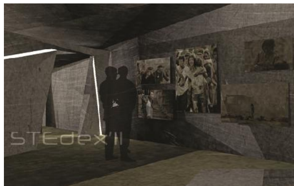
Visuospatially Of Destruction_4