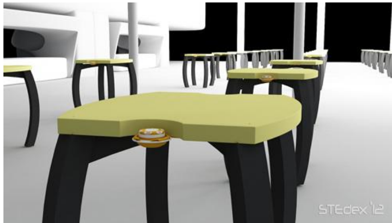
HE-PRO (Fly Repellent)_1