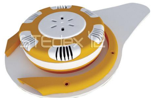
HE-PRO (Fly Repellent)_3