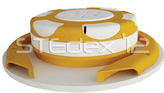
HE-PRO (Fly Repellent)_2