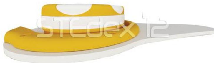
HE-PRO (Fly Repellent)_4