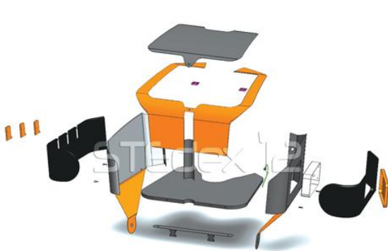
BOXXF (Motorcyclist Safety Compartment)_2