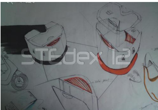
BOXXF (Motorcyclist Safety Compartment)_4