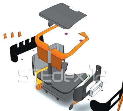
BOXXF (Motorcyclist Safety Compartment)_3