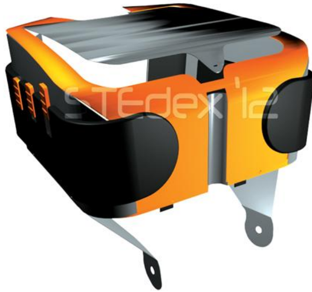
BOXXF (Motorcyclist Safety Compartment)_1