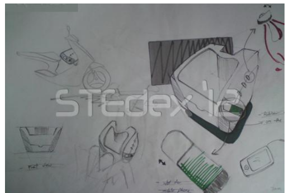
BOXXF (Motorcyclist Safety Compartment)_5