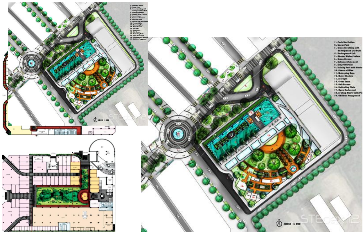
Revitalization of Pudu Plaza_5