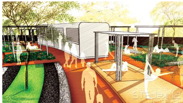
Revitalization of Pudu Plaza_2