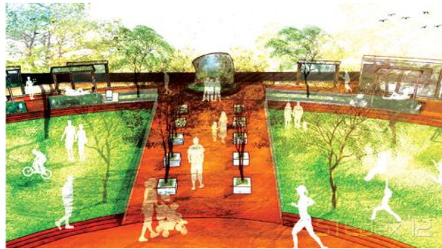
Revitalization of Pudu Plaza_1