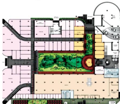
Revitalization of Pudu Plaza_4