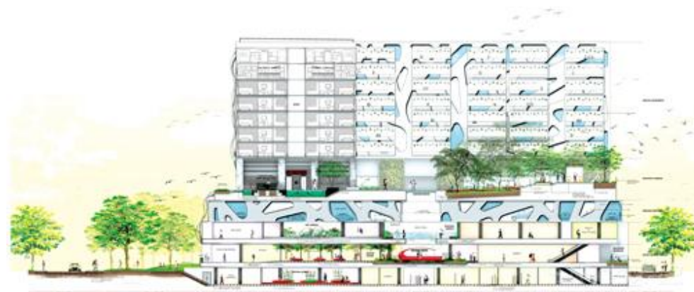
Revitalization of Pudu Plaza_6