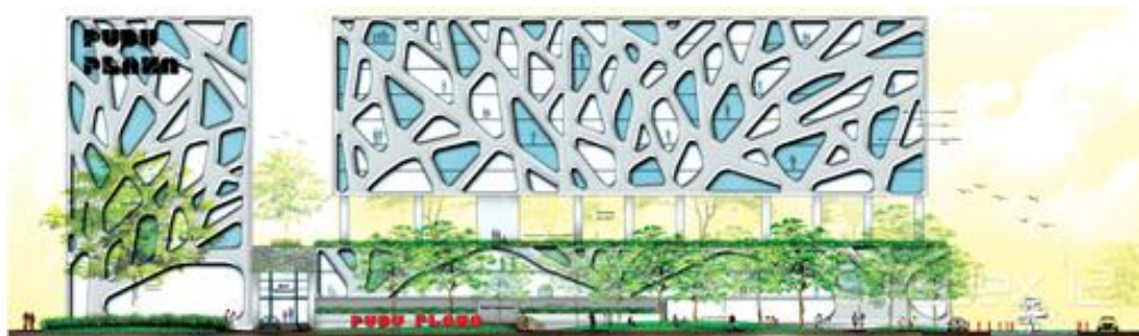
Revitalization of Pudu Plaza_3