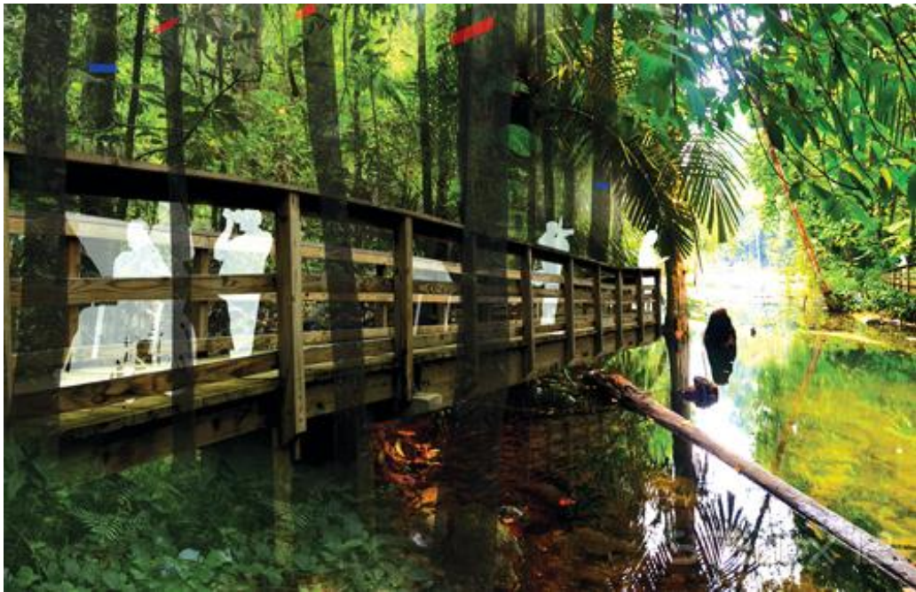
The Return for Return_4