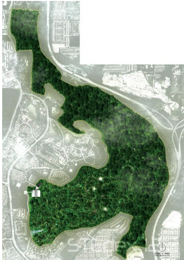
The Return for Return_1