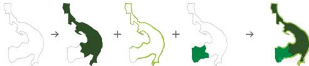
The Return for Return_2