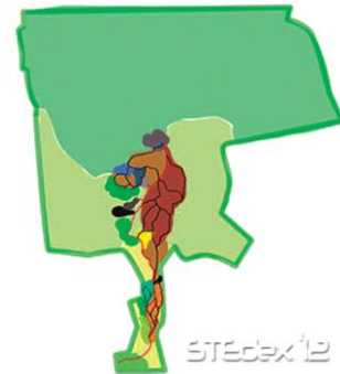
The Relic Rhapsody_4