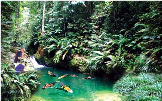
The Relic Rhapsody_6