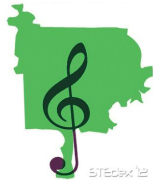
The Relic Rhapsody_3