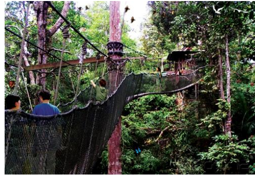
The Relic Rhapsody_7