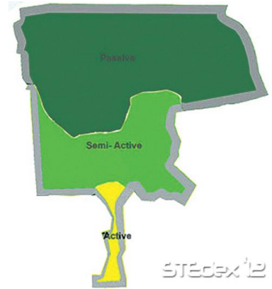
The Relic Rhapsody_2