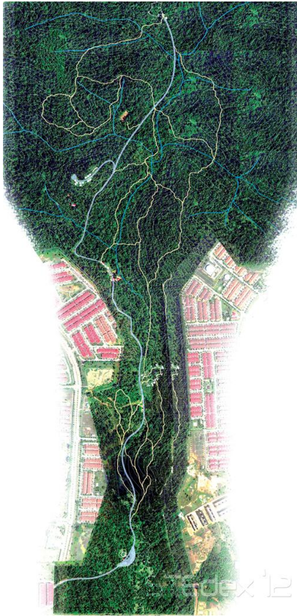
The Relic Rhapsody_1