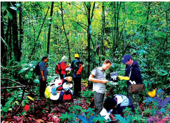
The Relic Rhapsody_8