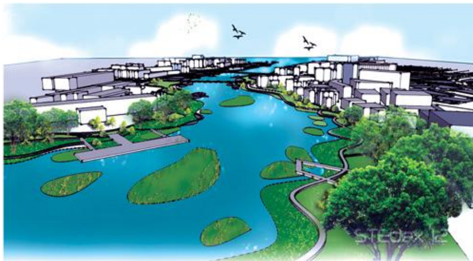
Healing with Nature_4