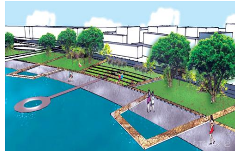
Healing with Nature_3