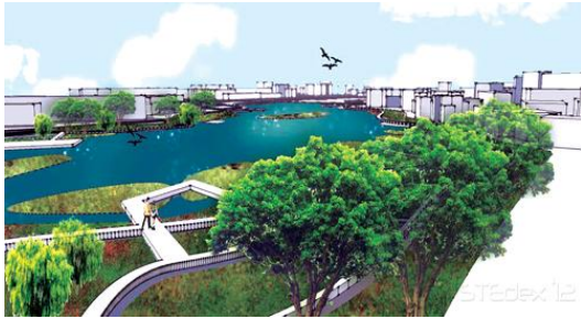
Healing with Nature_2