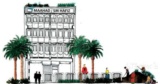
Didactic Room for River_4