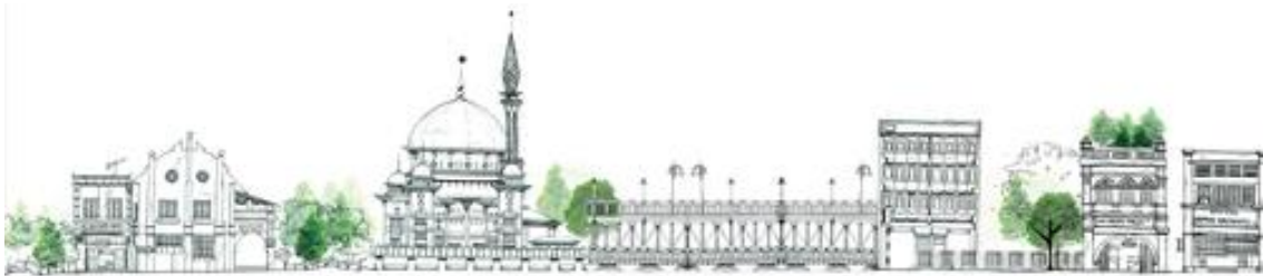
Didactic Room for River_3