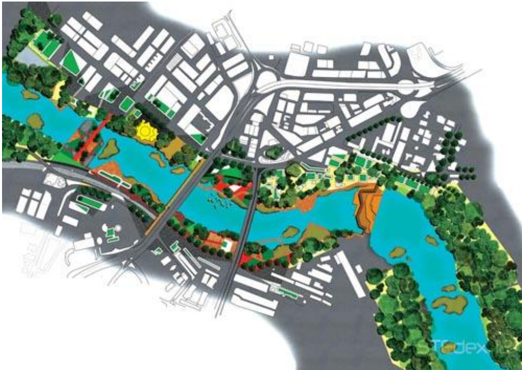
Didactic Room for River_2