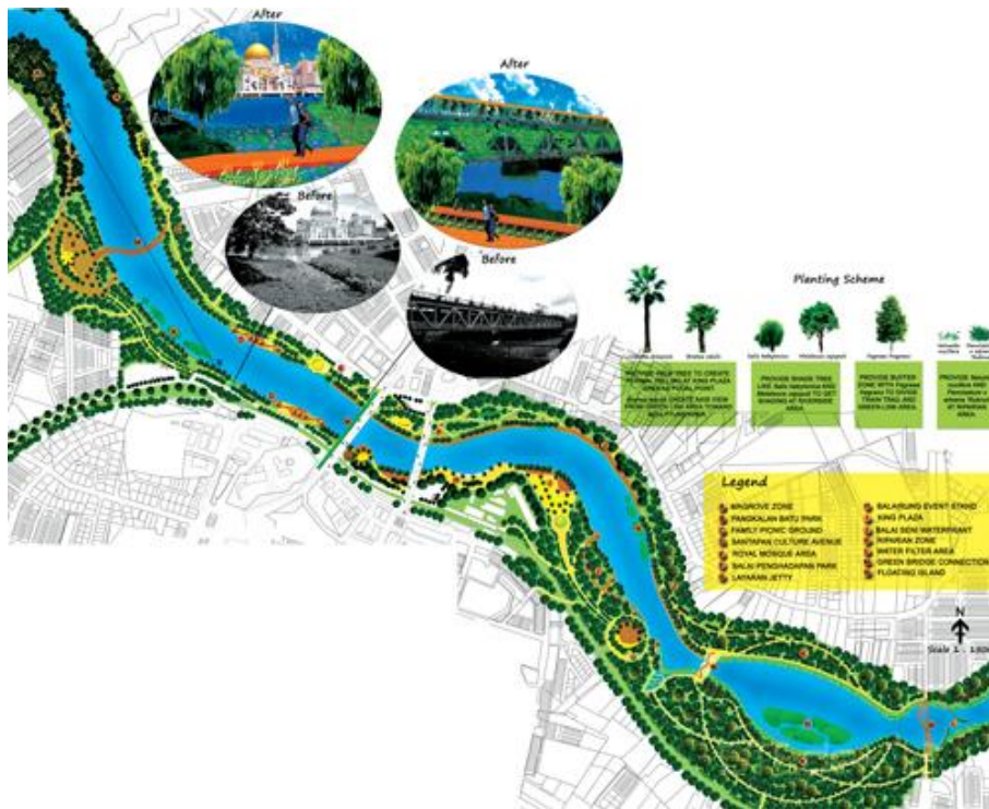
Bridging Royal + Nature_2