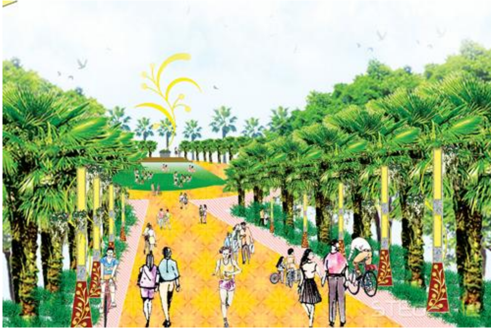
Bridging Royal + Nature_1