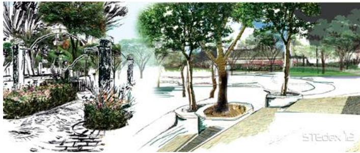
Students Center, UPM_4