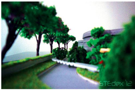
Students Center, UPM_2