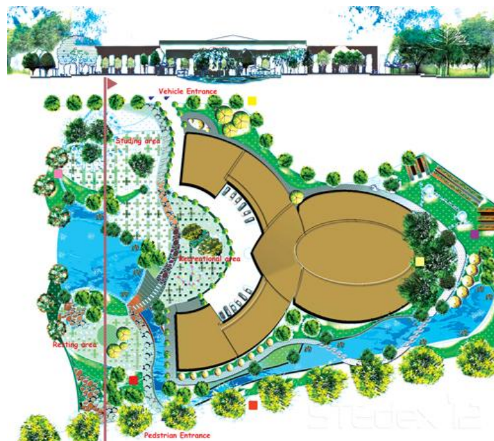
Students Center, UPM_1

The quality of outdoor spaces is important in contributing towards a better quality of life. The Students Center is a core public space that gathers students on campus for socializing and carrying out day-to-day activities. The design of related outdoor spaces is being influenced from the climatic condition of the site by blending together softscape and hardscape elements in providing a more comfortable and sittable space around. Using principles of unity and repetition, plant materials with dense canopy, screening character, contrasting colours, forms and suitable heights are selected for spatial definition. The designed form is being shaped by the natural settings and site topography.