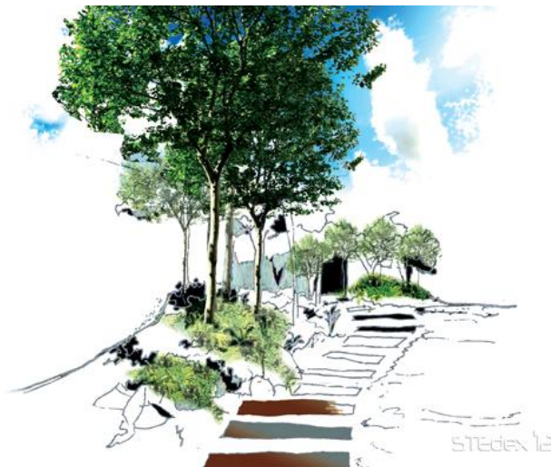
Students Center, UPM_1