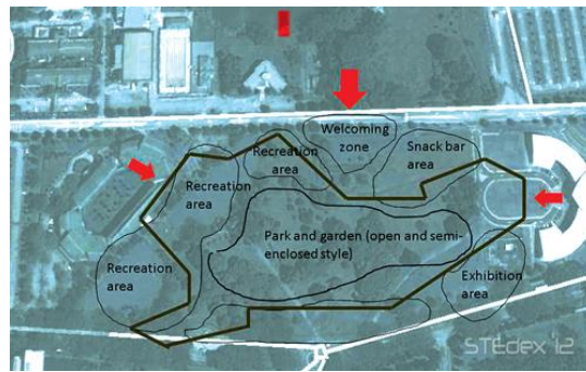
Initiating the Essential_1