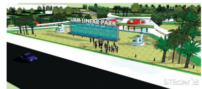
Initiating the Essential_5