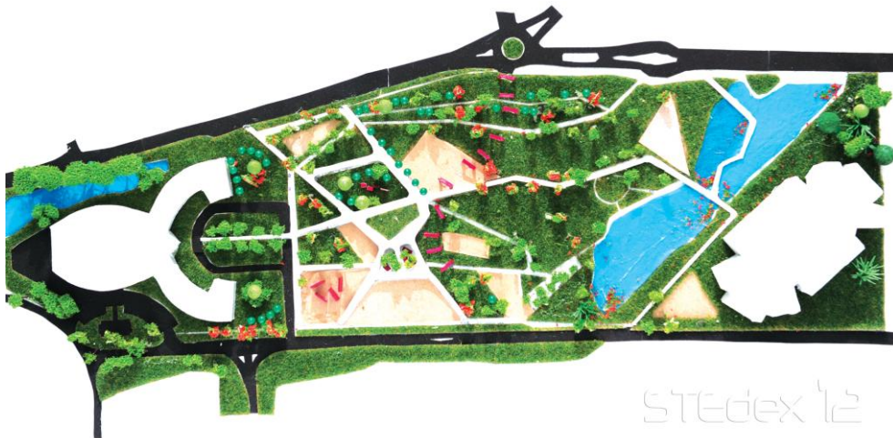
Initiating the Essential_2