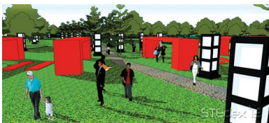
Initiating the Essential_3