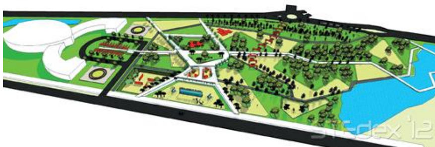
Initiating the Essential_6

First Year Second Semester Master of Landscape Architecture Student 2012