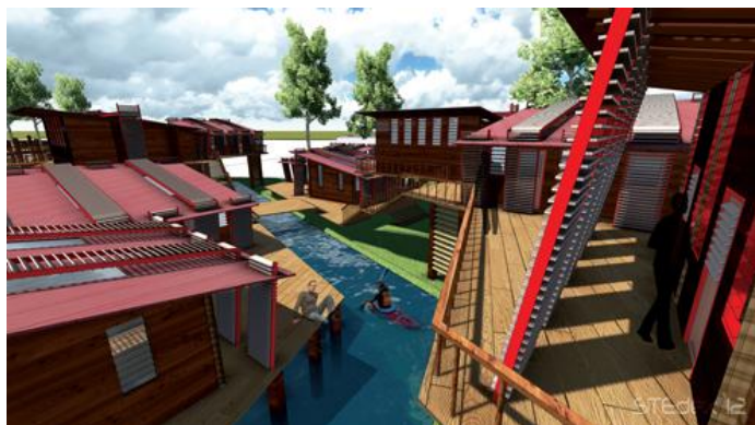
Reliving Kampung Flavour_4