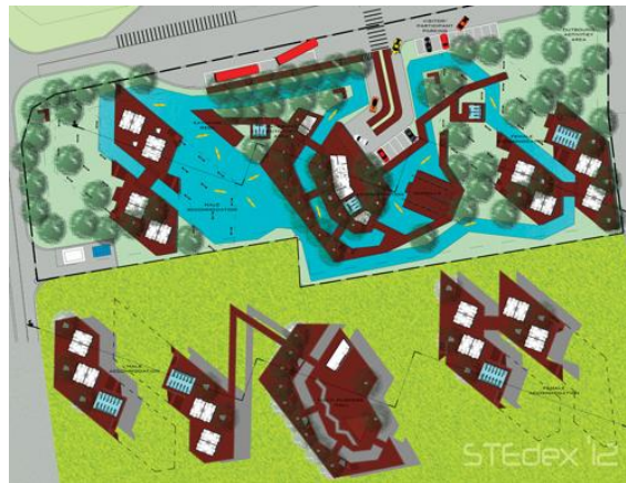
Reliving Kampung Flavour_3