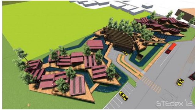
Reliving Kampung Flavour_2